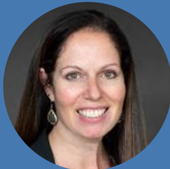
Commissioner Darcie L. Houck