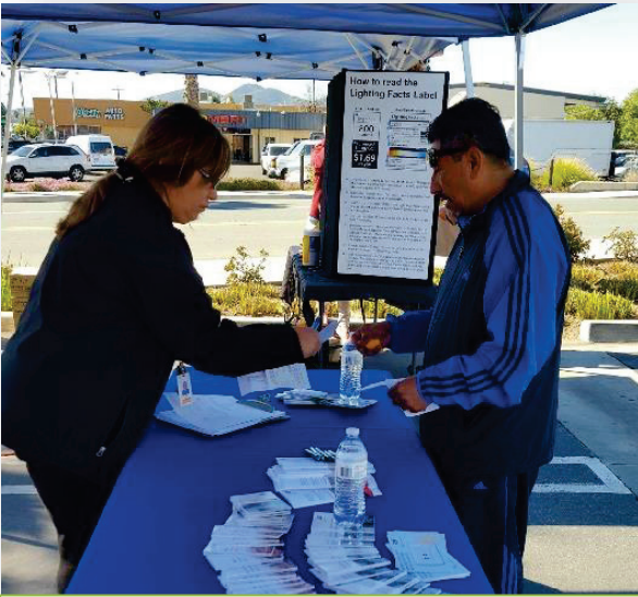
SDG&E Escondido Branch Office Customer Solutions Tailgate - 2/24/17