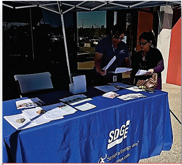
SDG&E Market Creek Branch Office Customer Solutions Tailgate - 3/03/17