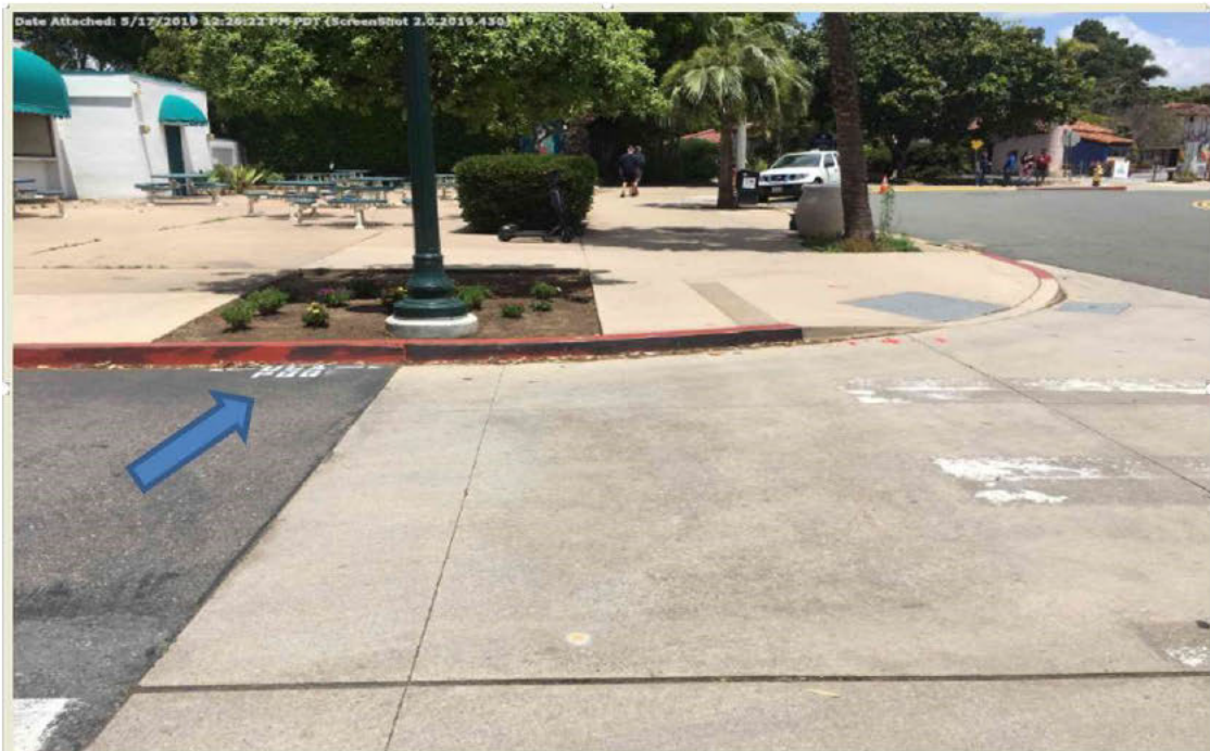
Image 3: Picture taken on Old Globe Way facing North at intersection of Village Place on May 17, 2019 during mark out. PGB USA mark stenciled to left of light post. This