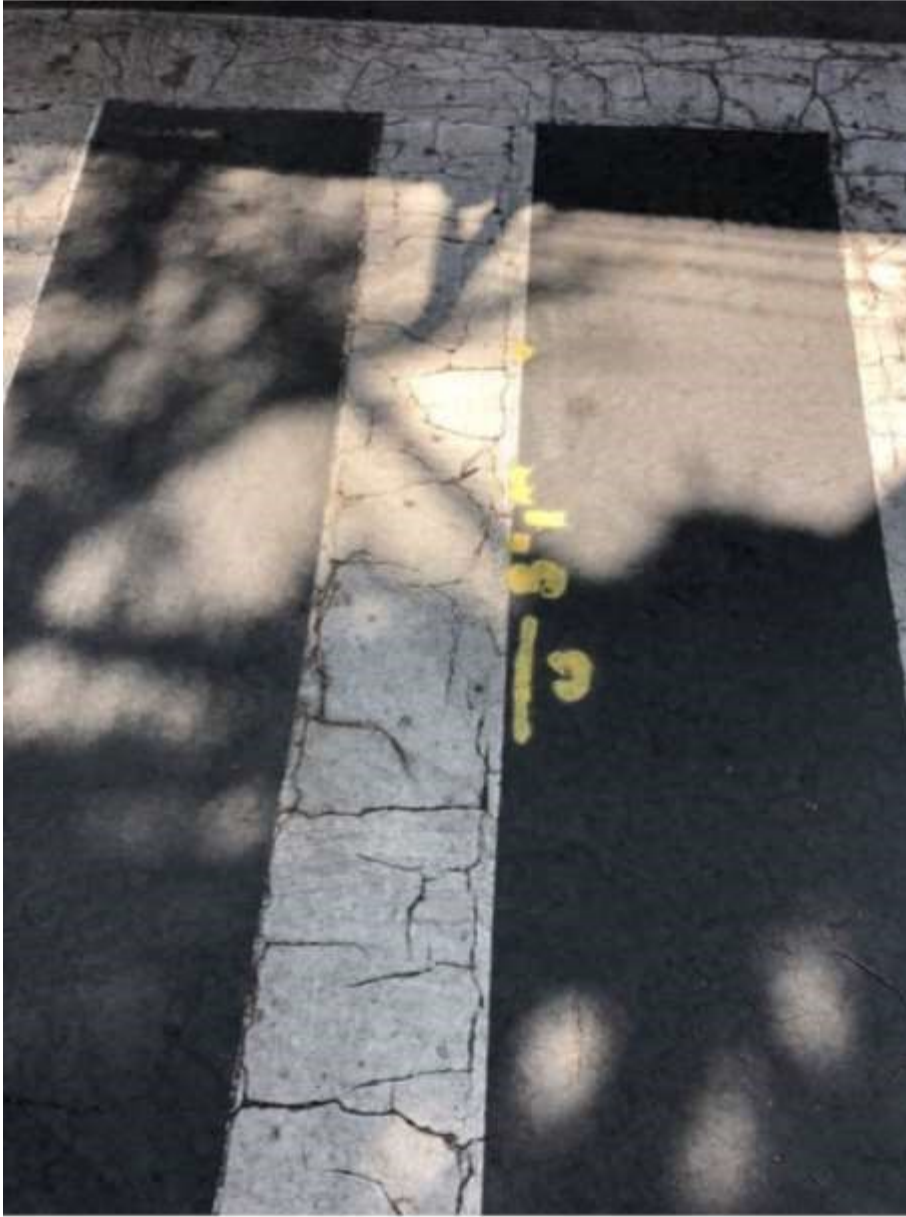
Image 7: Marks in area described on expired USA Ticket #A191060668 believed to be provided by Cable, Pipe and Leak locating employees.