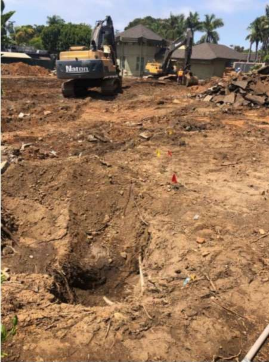
Image 8: Flags in area described on expired USA Ticket #A191060668 labeled Cable, Pipe and Leak.