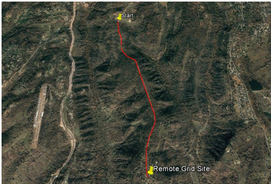
Residual ignition risk of “hardened” overhead