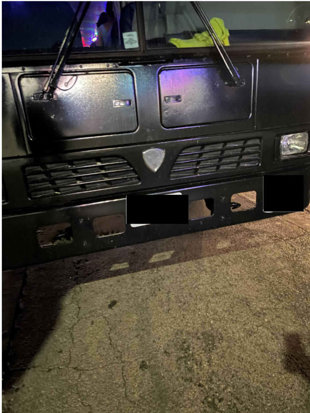
Attachment 7: Picture of License Plate # 39750P3